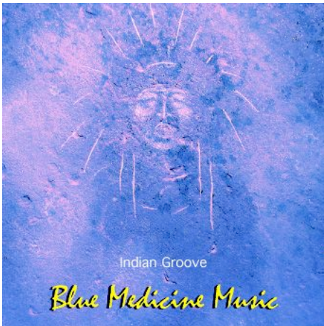
2005 “Indian Groove”