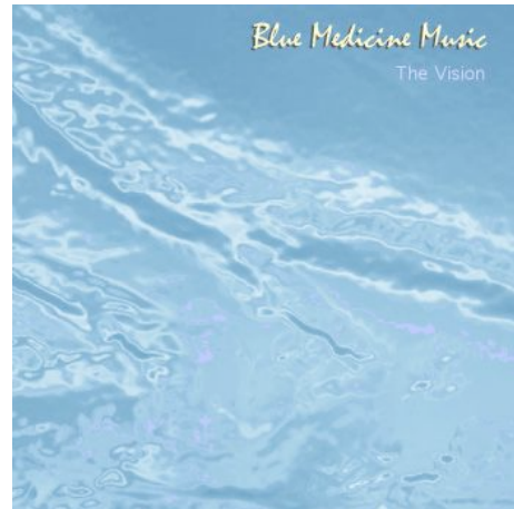
2006 “The Vision”

During their long friendship and partnership, they performed numeral concerts, had many art exhibitions and produced two CDs, you can get via Blue Medicine Music website.